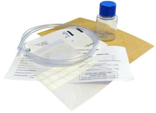
COOLKIT1 - FA-ST Coolant Analysis Kit

To have oils in Coolants analysed by FA-ST in our independent laboratory, then all you need is one of our PRE-PAID coolant sampling & analysis kits. This kit comes with everything needed to extract samples and sent them in to our independent ISO accredited laboratory. Once received the at the lab we will e-mail a PDF report 2-3 days after receipt of the sample. The report will have details on critical factors such as Wear levels, Contamination and Chemical make-up of the coolant and our laboratory technicians' comments and recommended actions if required.